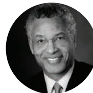
Gene A. Washington Retired Director of Football Operations for the National Football League (NFL)